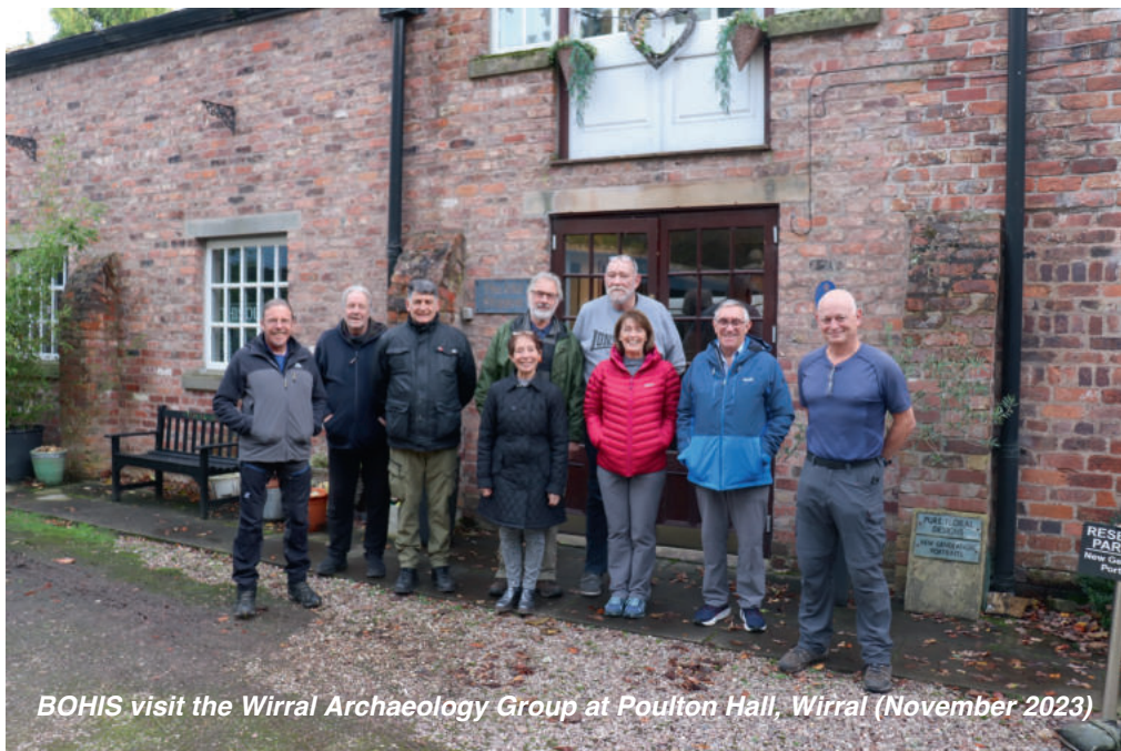
BOHIS visit the Wirral Archaeology Group at Poulton Hall, Wirral (November 2023)