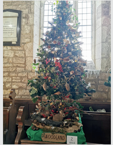
The winning tree designed by the Villagers Group